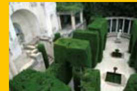
INSTITUTO GÓMEZ MORENO Tel: 958 227 497

Apart from its wonderful gardens, it is well worth visiting the inside, particularly the library.